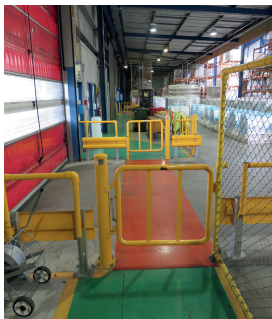
Physical barrier segregate plant and pedestrian areas