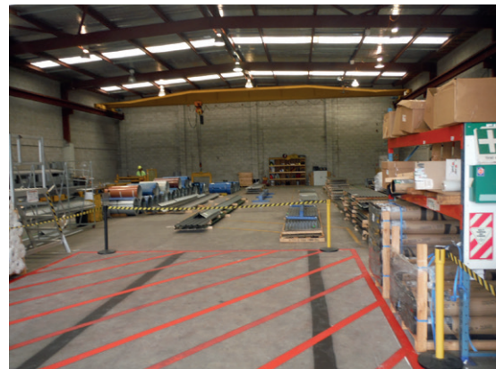
Barriers and floor markings indicate designated loading area