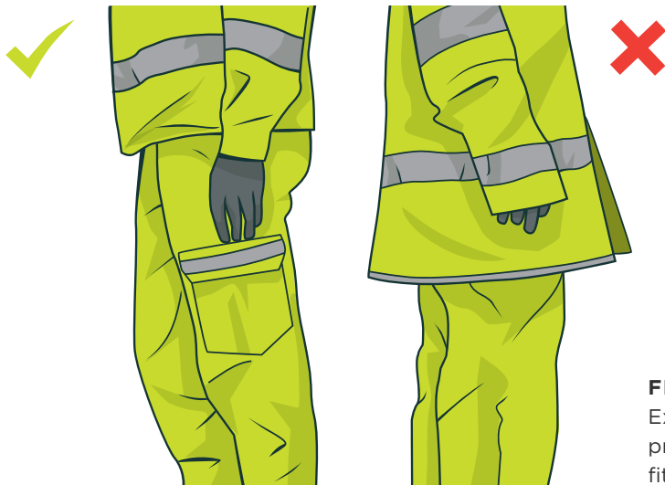
FIGURE 2: Example of well-fitting protective clothing and poorly fitting protective clothing