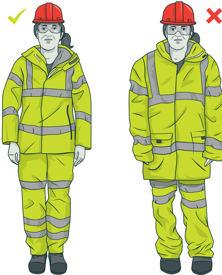
FIGURE 3: Example of well-fitting protective clothing and poorly fitting protective clothing